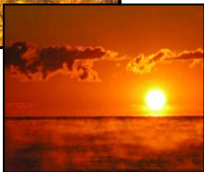
Sunrises and Fireworks — a magical place from dawn to dusk!