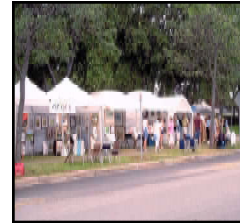
Browse arts & crafts during the 33rd Annual "Art on the Bay" at beautiful Bay View Park, July 18-19