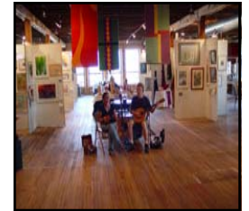
Relax in the ambiance of Art in the Loft. Have lunch, take a workshop or meet one of the 35 exhibiting artists.

An Alpena Arts & Culture Basket filled with season tickets, gifts certificates and local products