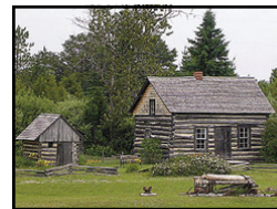
Step back in time at Log Cabin Day on June 27 at the Besser Museum for Northeast Michigan

At each stop on your trip, your passport will be stamped by the participating business or organization. Some of them even offer special discounts and promotions to Passport holders.