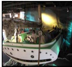
Experience a storm at sea on a replica of a 1870's Schooner at the Great Lakes Maritime Heritage Center

Visit ten of the events listed in the Passport Calendar in order to be eligible for great prizes, including the Grand Prize – a trip for two to New York City!